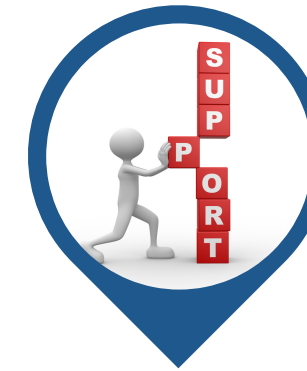
Supporter $5,000 - $14,999