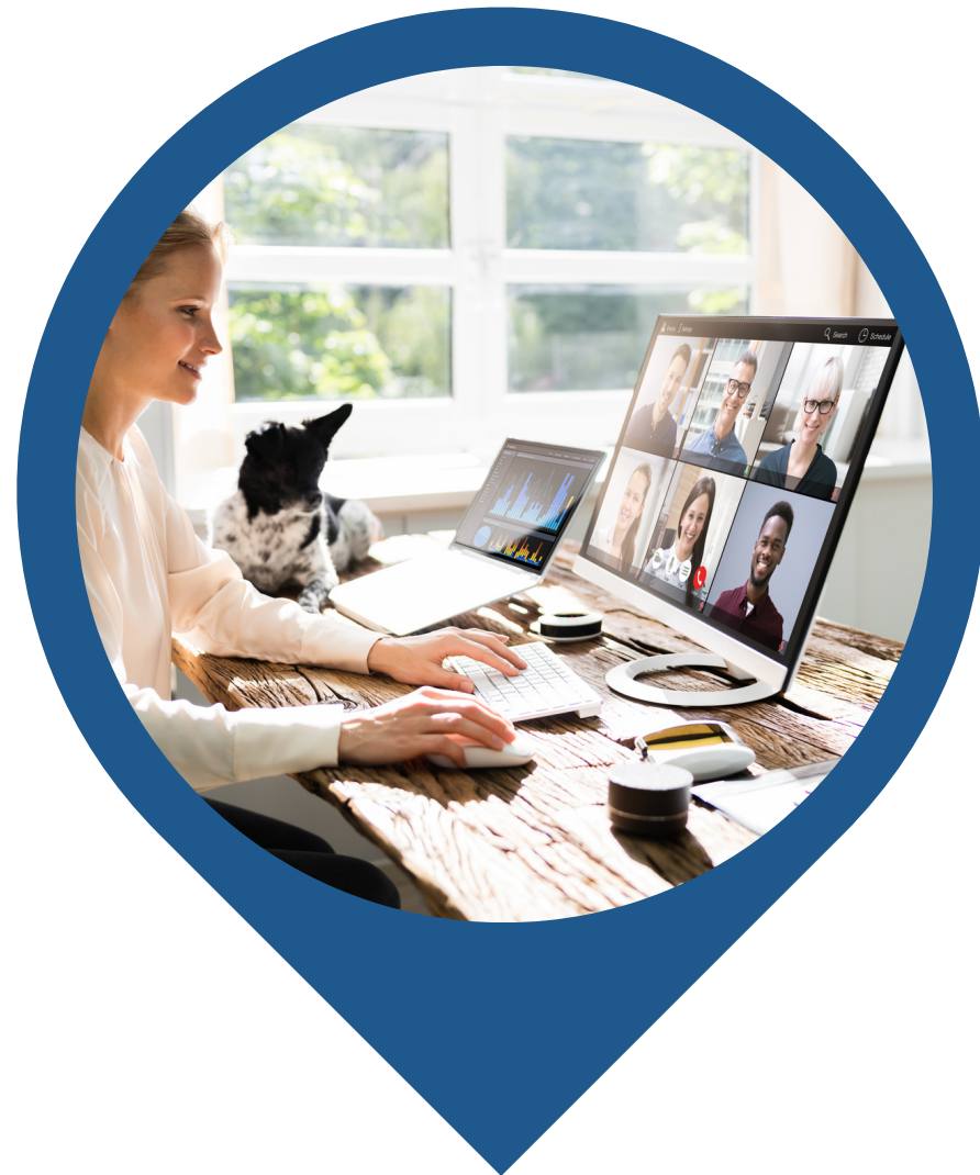
Network & Community Experience (NCE)

As you move through these opportunities, remember to consider that more than half of ASCPT members will continue to enjoy opportunities in a virtual-only format. Therefore, it's important to recognize a hybrid audience and how you can engage them throughout the year.