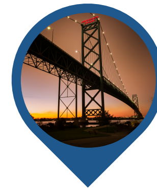
Ambassador $15,000 - $29,999