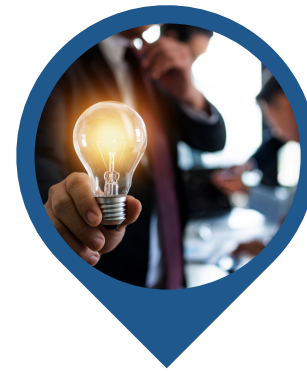
Innovator $30,000 - $49,999